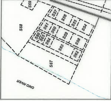
DETAIL "B" Scale 1"=500'