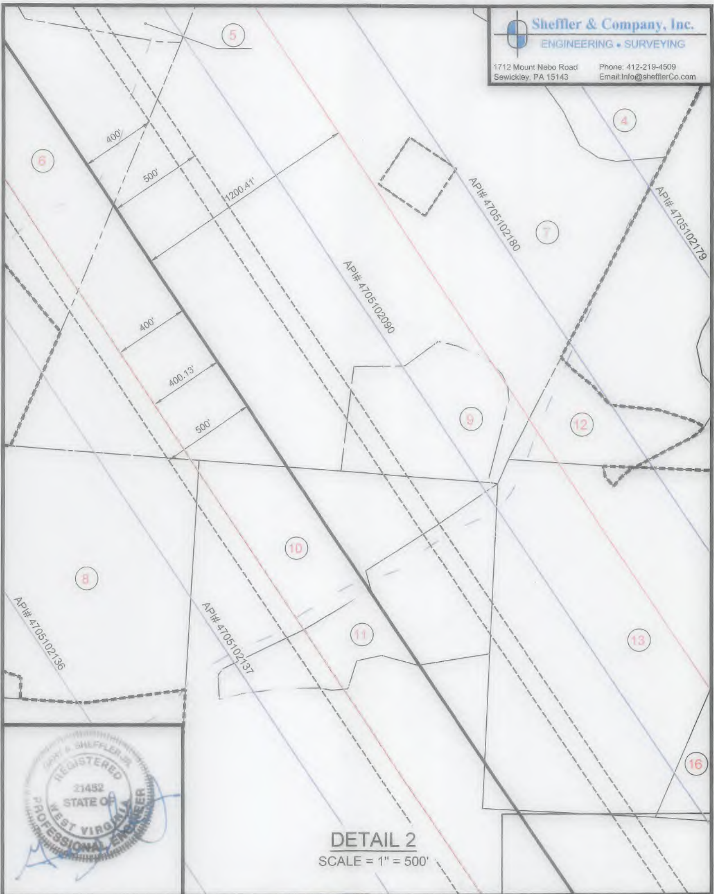
DETAIL 2 SCALE = 1" = 500'

Phone: 412-219-4509 Email: Info@shefflerCo.com