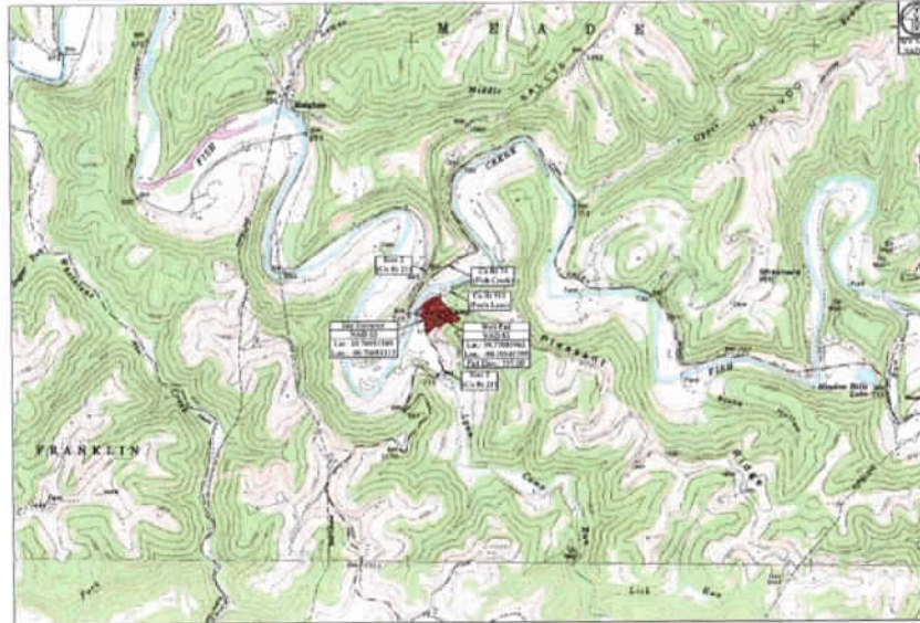
Exhibit A: As-Built