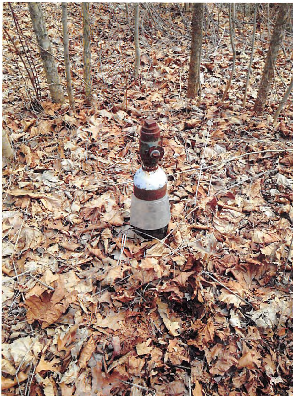
J.M. Tennant Well No. 2 47-061-00781

Plugging Methods (35-4-14): The operator shall remove/bail all oils and or salt waters from the well prior to initiating the plugging process. The oil/water encountered and removed will be disposed at a certified landfill or disposal facility. The operator is proposing to set a mechanical or electronic plug immediately above the shot hole or below sea level elevation based on conditions encountered. The operator does not know how deep the well is so the actual depth will be determined as the casing is removed. Once the mechanical or electronic plug is set, a 100 cement plug will be placed, allowed to set, then tagged to verify depth before filling with API Class A Portland Hydraulic Cement (with a Calcium Chloride content of 3% or less and no other additives) should it become necessary and pending Inspector approval Aqua Gel or Hole Plug may also be used. The Cement grout shall be placed in the hole under pressure using a string of 1 ½ inch Tubing and cement pump. Previously, the Osage No. 1