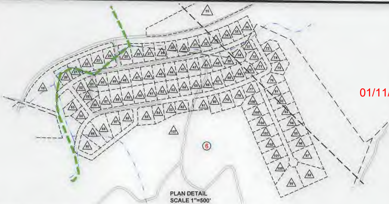
PLAN DETAIL SCALE 1"=500'