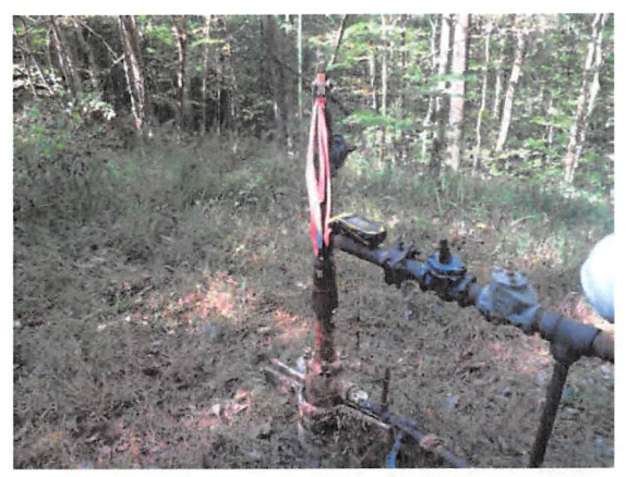
WV 604880 Well Pad Site RECEIVED Office of Oil and Gat