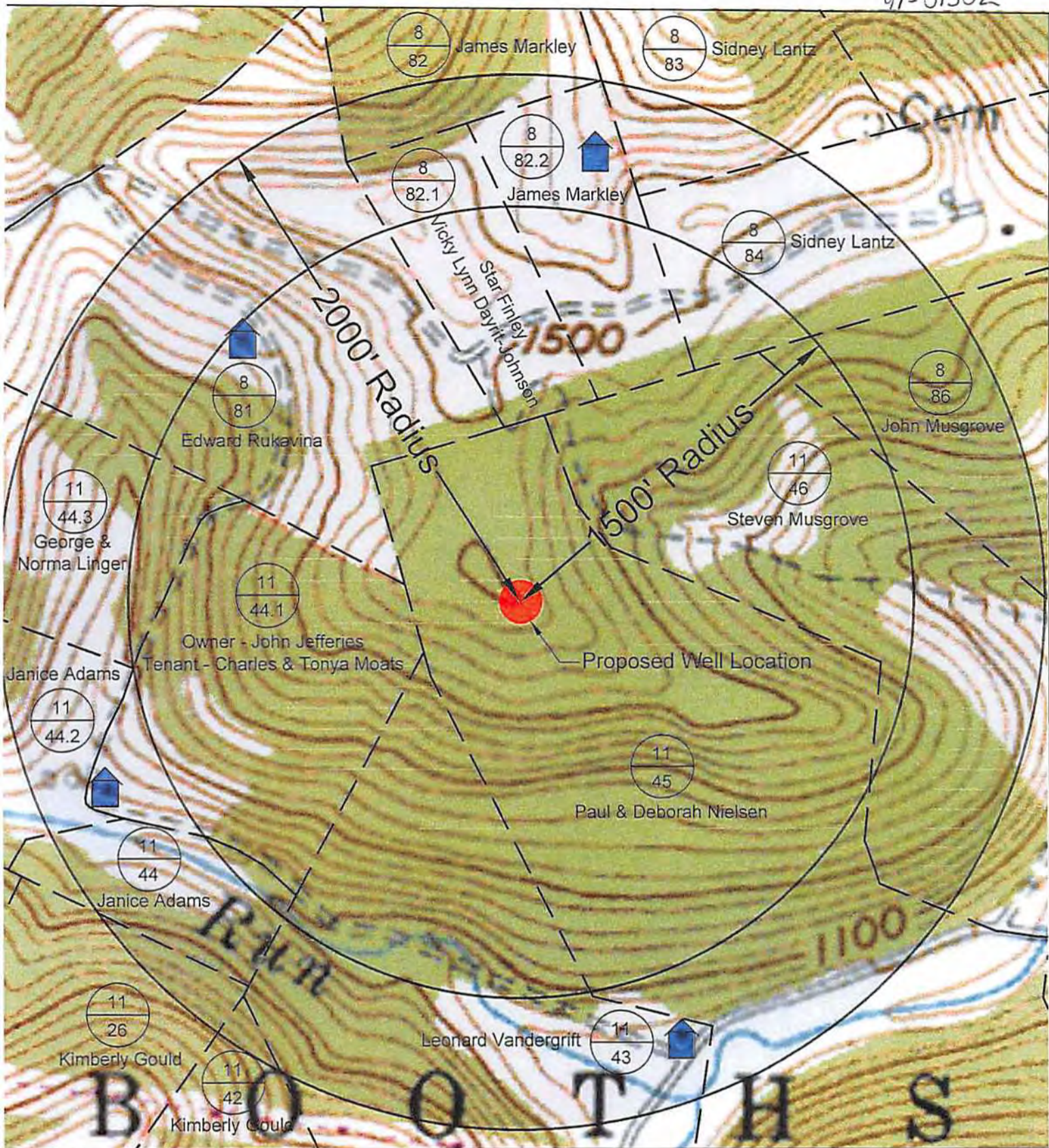
Coulson Pad Landowner Parcel Table