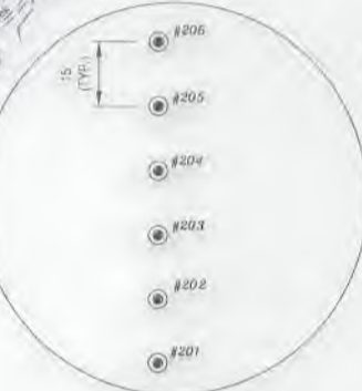
REFERENCES TO PROPOSED HORIZONTAL WELL SURFACE LOCATIONS NTS

FILE#: 17078-007 SHEET#: 1 of 2 SCALE: 1" = 3000' TICK SCALE: 1" = 2000' MINIMUM DEGREE OF ACCURACY: 1/200 PROVEN SOURCE OF ELEVATION: WV-RTN CORS STATION