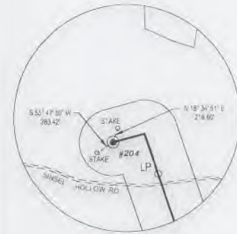
REFERENCES TIES (NTS)