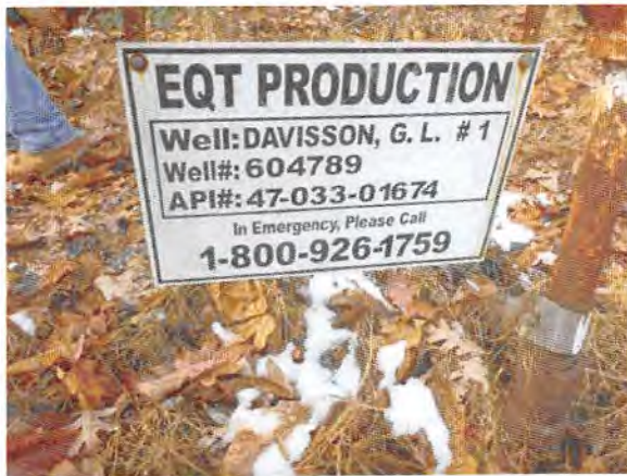
WV 604789 Well ID Sign