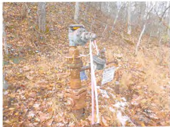
WV 604789 Well Pad Site

RECEIVED Office of Oil and Gas MAY 11 2020 WV Department of Environmental Protection