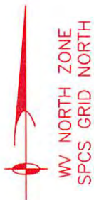
MAP REFERENCE: U.S.G.S. WALLACE, WV

WELL: 4703304158: MORRIS E-231 LAT: 39.333990 LON: -80.461503 N: 4353979.1 (UTM17) E: 546409.5 (UTM17) ELEV: 1088'