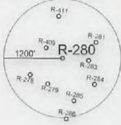
SURROUNDING WELLS WITHIN 1200' RADIUS