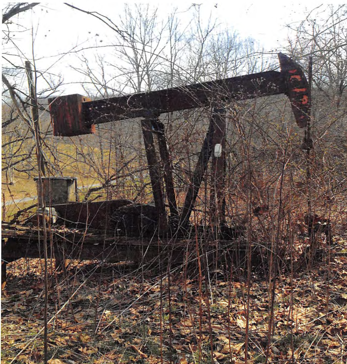
Amanda Tennant Well No. 1 47-061-00779

Plugging Methods (35-4-14): The operator shall remove/bail all oils and or salt waters from the well prior to initiating the plugging process. The oil/water encountered and removed will be disposed at a certified landfill or disposal facility. The operator is proposing to set a mechanical or electronic plug immediately above the shot hole or below sea level elevation based on conditions encountered. The operator does not know how deep the well is so the actual depth will be determined as the casing is removed. Once the mechanical or electronic plug is set, a 100 cement plug will be placed, allowed to set, then tagged to verify depth before filling with API Class A Portland Hydraulic Cement (with a Calcium Chloride content of 3% or less and no other additives) should it become necessary and pending Inspector approval Aqua Gel or Hole Plug may also be used. The Cement grout shall be placed in the hole under pressure using a string of 1 ½ inch Tubing and cement pump. Previously, the Osage No. 1