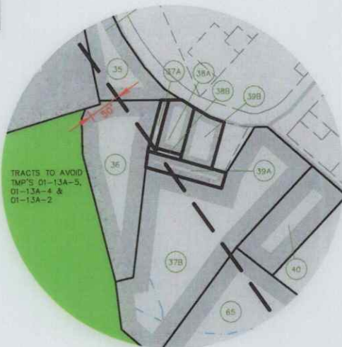
DETAIL A 1" = 200'