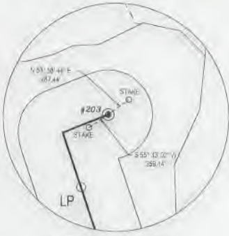
REFERENCES TIES (NTS)

SURFACE HOLE (NAD27) LAT: 39.258581597 LON: -80.169253487