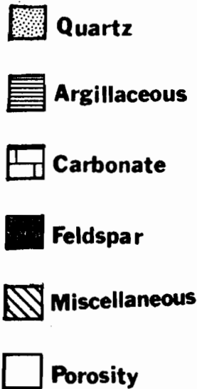
Figure 17. Point count data from well #10746 (permit number: Barbour-243)