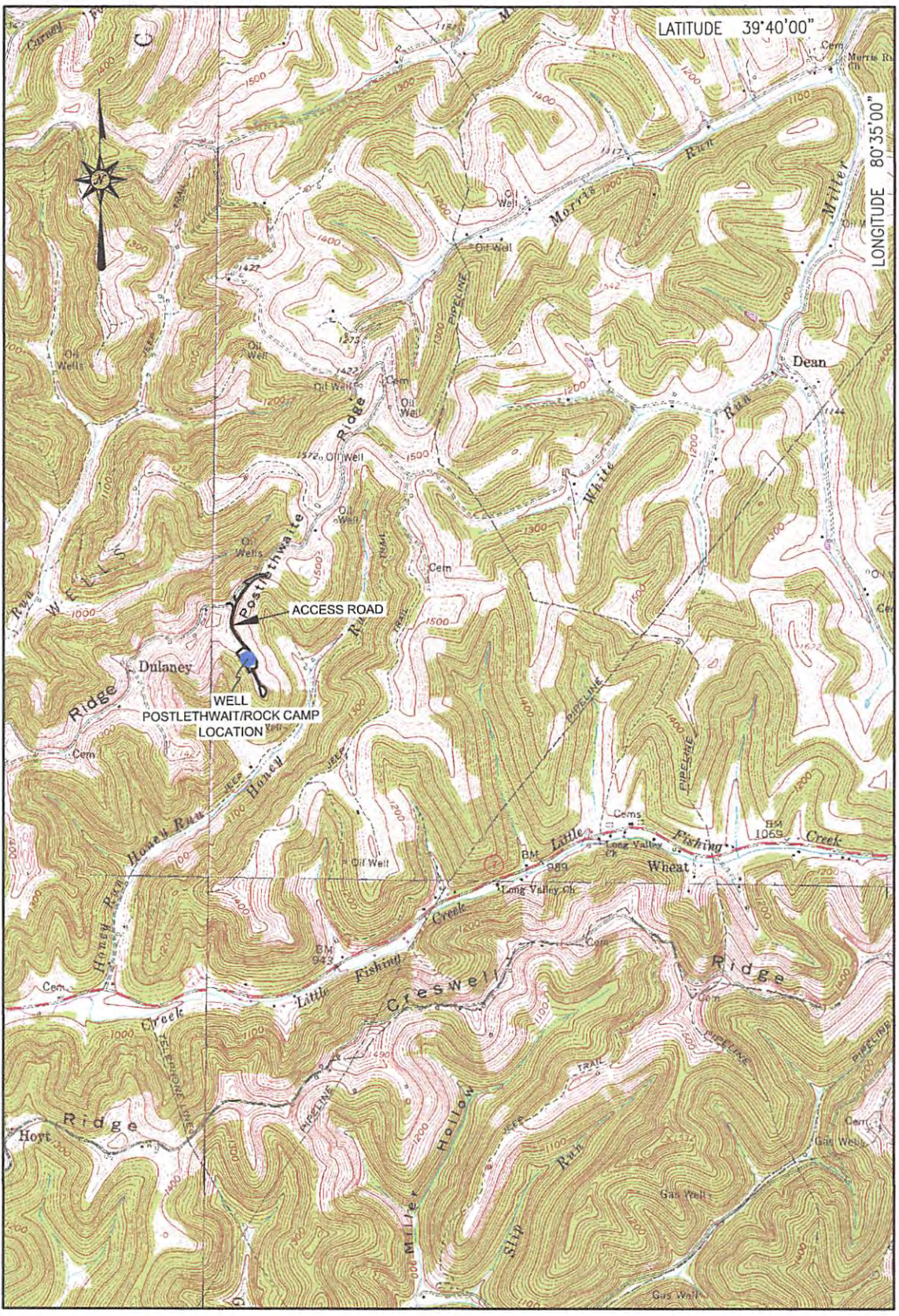
LOCATION MAP AUGUST 24, 2016

Blue Mountain Inc. 10125 MASON DIXON HIGHWAY BURTON, WV 26562 PHONE: (304) 662-6486